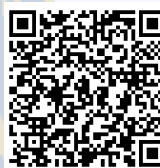
Request to Withhold Personal Information Form