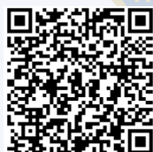
Public Records Exemption Request Form Florida Dept. of State